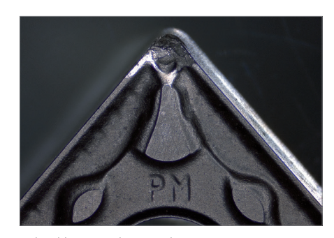
Indexable insert, shows tool wear. Reflected light, ringlight, zoom 0.8×