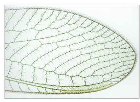
Green lacewing Transmitted light brightfield